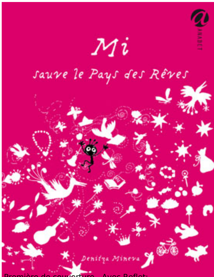
Première de couverture - Avec Reflet: